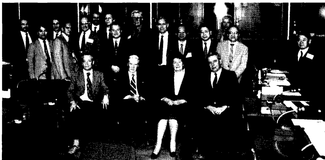
WHO / T. FARKAS

The Committee met annually and reviewed the situation in relation to all aspects of post-eradication activities (Global Commission recommendations 1–19). In 1984 the Committee undertook a comprehensive review of the human monkeypox programme, published a report on current knowledge of the disease ( Bulletin of the World Health Organization , 1984), and made recommendations for future activities (WHO/SE/84.162). In 1986 it reviewed the operation of the post-smallpox-eradication programme and made recommendations on all its aspects. The Committee's report was published ( Wkly epidem. rec. , 1986b) and widely circulated; its recommendations have been discussed in the relevant sections of this chapter.